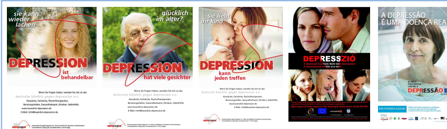
Figure 2: Example of PR Material in Germany, Hungary and Portugal:

Moreover, within the EU-funded suicide prevention project OSPI-Europe ( www.ospi-europe.com ), this 4-level-approach was further optimized, implemented and evaluated in four European regions (2008-2012).