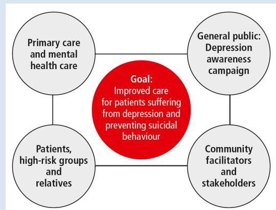
Fig. 1: EAAD 4-level intervention programme; overview of the approach, which had been implemented in 17 countries during the projects EAAD I and II (between 2004 and 2008) and within the EAAD association (2008 onwards)

In order to sustain, continue and expand the work and activities from the EU-funded EAAD projects, a non-profit research organization, the European Alliance Against Depression e. V. (EAAD) was founded in 2008 by a number of mental health experts from different European research institutions.