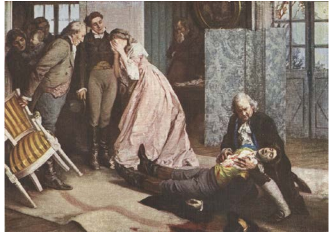
Image 1: http://jamesharfordeuro3301.wordpress.com/2012/09/21/seminar-6-epistolary-extremes-goethes-werther

Certain kinds of media reports on suicides can provoke succeeding suicidal actions due to imitation. Scientific literature refers to this as the "Werther-Effect". After the publication of Johann Wolfgang von Goethe's famous novel "The Sorrows of Young Werther", copycat suicides of young men occurred all over Europe. The suicides very much followed the novel's pattern and model.